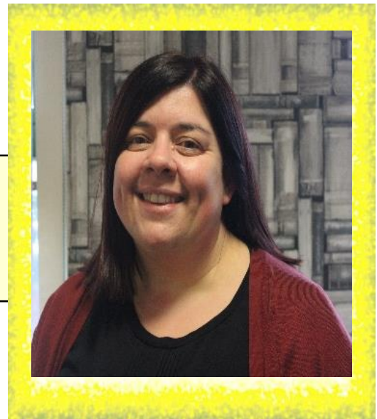
Miss Shackell 6H Phase Leader for 5 and 6